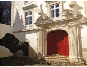
Belmonte Palace, Lisbon